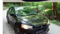
2011 Mitsubishi Evolution