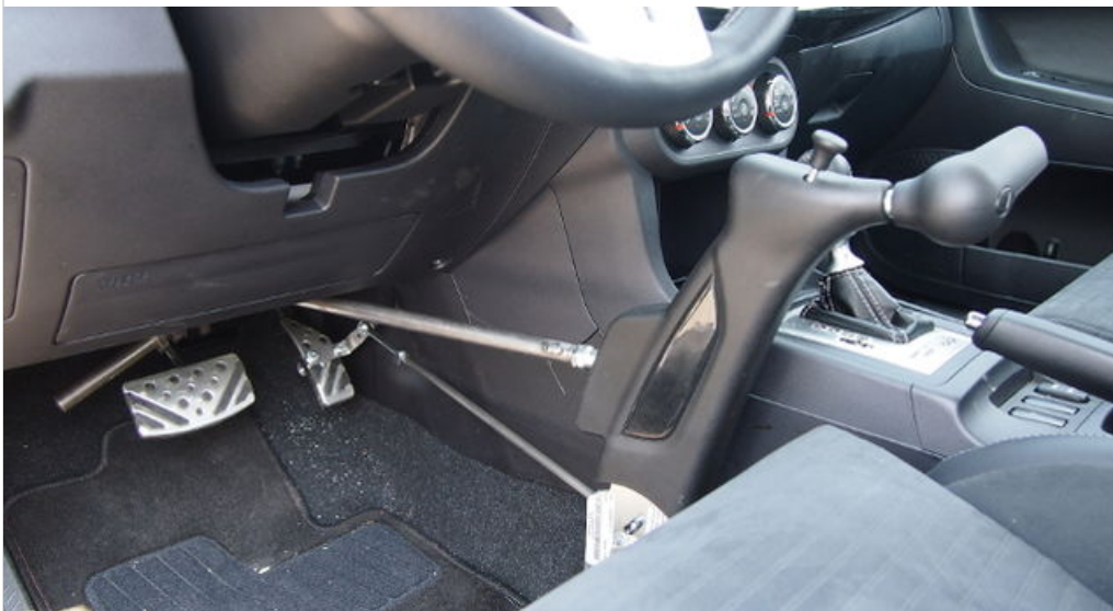
BLIND PORSCHE KOD MITSUBISHI MODIFIED - HAND CONTROLS 1