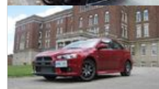
2010 Mitsubishi Lancer Evolution